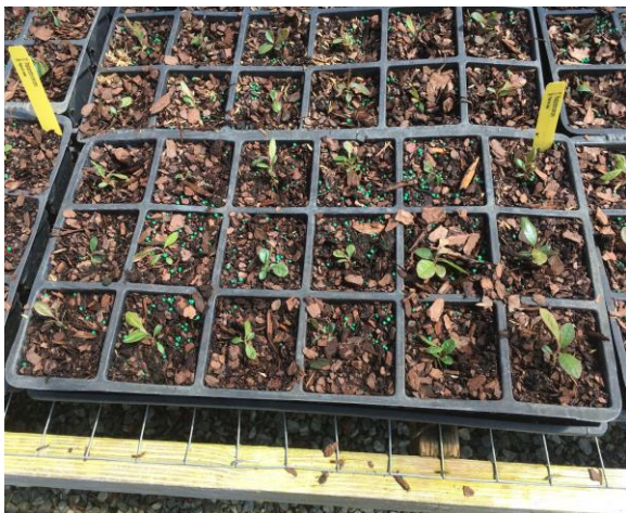
Figure 4. Freshly transplanted Rhododendron canescens seedlings, April 1, 2018

Seedlings are taken from the flats in chunks and carefully separated to preserve the roots. We have built ourselves a dibble board with wooden dowels, which we press onto the flats to make the necessary holes in each cell to plant into. Transplanting seedlings at the correct depth requires some skill (Figure 4). Each tiny plant needs to be placed no deeper than it was originally growing in the flat, but not so high in the cell that the small plant flops over when watered. We generally assign this task to our most skilled workers - because so much of the quality of our future crop depends upon this step. Once each flat is complete, we sprinkle 20 grams of Harrell's Polyon® 16-6-11+ micro-controlled release fertilizer (CRF) evenly over the entire flat, and water thoroughly by hand.