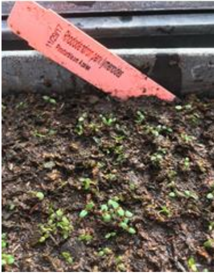
Figure 2. Rhododendron periclymenoides seedlings in flats in early January after being sown in November 29, 2017.

When germination has clearly begun, we begin our maintenance schedule which involves weekly drenching with products to provide fertility and protect against pests and diseases (Figure 2). Fungus gnats and fungal diseases are the main pests that we worry about during this stage.