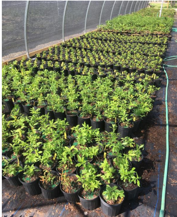
Figure 7. Bed of 1-gal Rhododendron atlanticum , June 12, 2018. Seedlings were transplanted March 22, 2018.

Three-gal plants may be hedge trimmed once after blooming, if needed. We make a pass through 3-gal crops in June or July to hand-prune branches growing at strange angles.