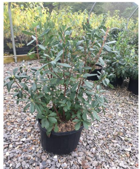
Figure 8. Growth of 1-gal Rhododendron atlanticum on June 6 (left) and September 28 (middle); seedlings were transplanted on March 22, 2018. Growth of 3-gal Rhododendron atlanticum on 26 September 2018 (right); seedlings were transplanted on 15 March 2018.