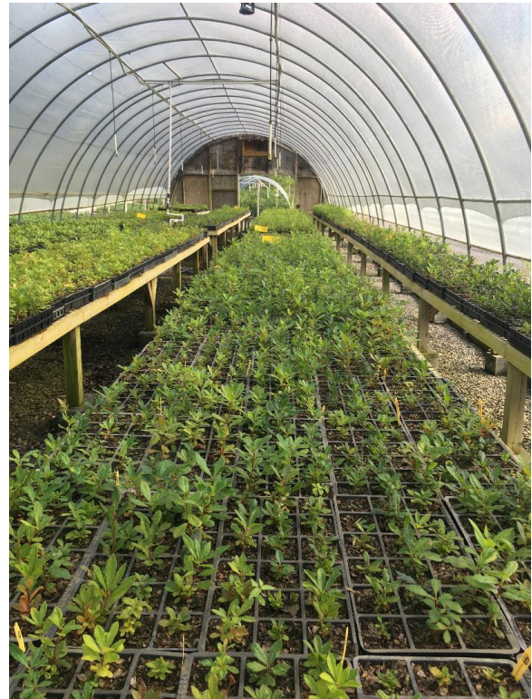
Figure 5. Azalea liners in propagation house, September 2018.

Once a block of seedling transplanting is complete, we drench with Actinovate ( Streptomyces lydicus strain WYEC 108) or a similar biological fungicide. If transplanted by the first of May, seedlings can be expected to fully root into cells before the first of September (Figure 5). We use a hedge trimmer to prune the seedlings back to a consistent height about two months after transplanting, when lots of active growth is present. We repeat this trimming 2-3 more times throughout the season to encourage branching.