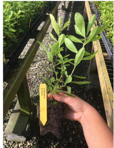
Figure 6. Rhododendron austrinum liners, Sept 4, 2018. Transplanted on April 20, 2018.