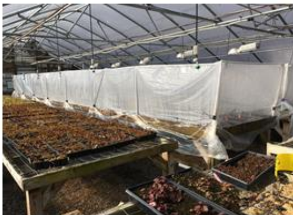
Humidity tent over bottom-heated bench

Community flats are placed on bottom heat inside of a 3-mm clear poly humidity tent (or with individual humidity domes on each flat) within the greenhouse and monitored carefully for moisture (Figure 1). Flats should not dry out on top, nor should they be soaking wet. A thermostat is set using a soil sensor to keep the root zone at about 21°C (70°F). During extremely cold weather, we may turn the bottom heat setting up around 24°C (75°F) to ensure the tent stays at or above 10°C (50°F) overnight. A continuous photoperiod is provided using 600w HPS lights that come on at dusk and turn off at dawn. Germination should occur within about 3-4 weeks; at which time we begin a weekly maintenance schedule to provide fertility and avoid pest and disease threats.